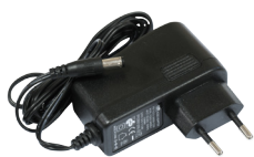
24V 0.38A Power adapter